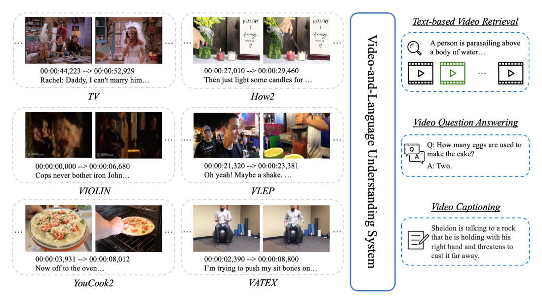
Figure 1: An illustration of VALUE benchmark. VALUE provides a one-stop evaluation for multi-channel video understanding on 3 common video-and-language tasks: ( i ) text-based video retrieval; ( ii ) video question answering; and ( iii ) video captioning. The videos in VALUE come from 6 data sources, covering diverse genres and domains.