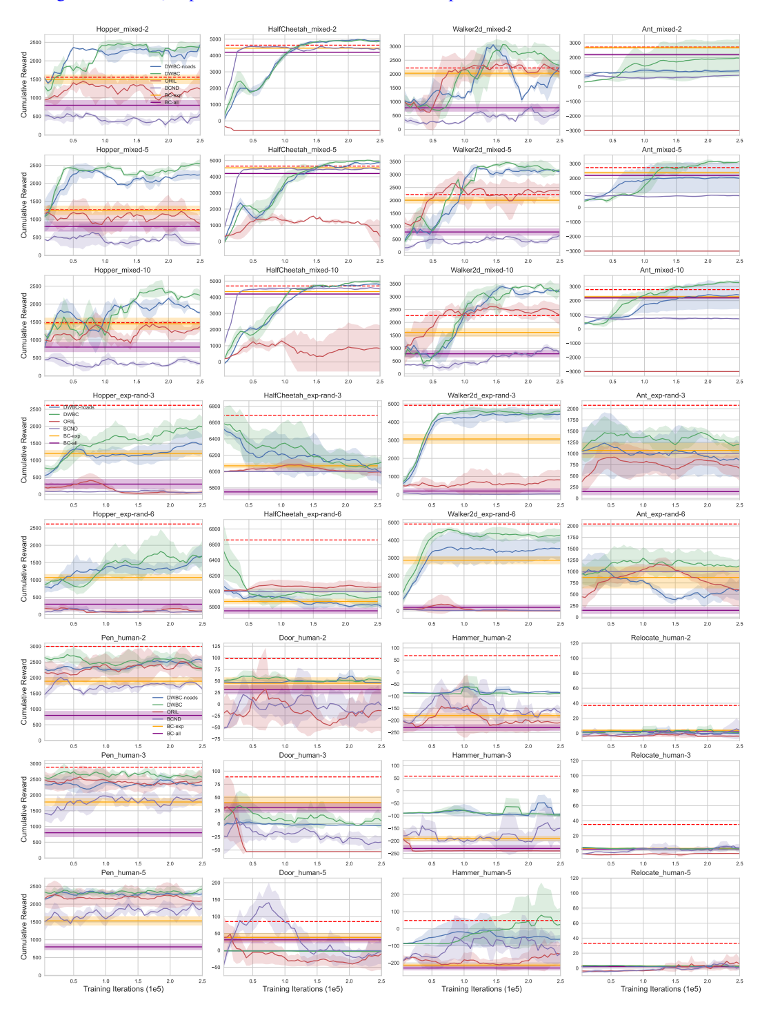
Figure 4: Learning curves of compared algorithms on different datasets.

In this section, we provide the learning curves of listed algorithms in Section 5. As the learning procedure of BC is quite fast and stable, for more clearly presentation, we plot the results of BC-exp and BC-all as a horizon bar with the shaded area as the standard deviation across different seeds. The average return in \mathcal{D}_e is plotted as the red dashed line in all plots.